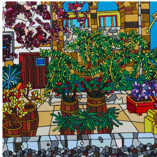
Left: 《DHL》 2022, Acrylic on Canvas, 20 x 20 x 5.5cm Right: 《BEDUA》 2024, Acrylic on Canvas, 70 x 70 x 6.5cm