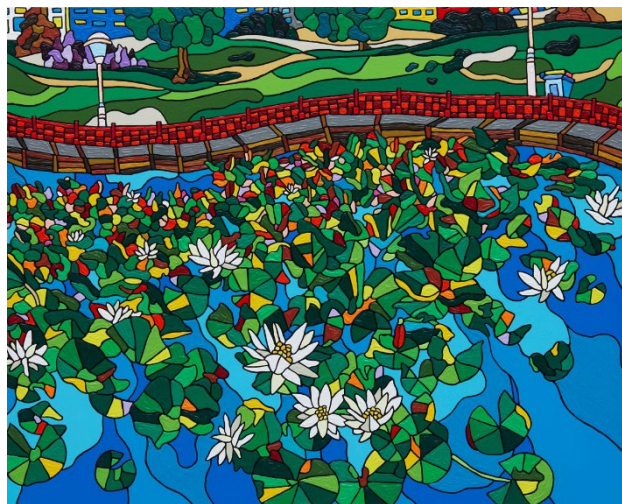
Left: 《A14》 2023, Acrylic on Canvas, 24 x 18 x 5.5cm Right: 《Weinsbergspark, Berlin》 2023, Acrylic on Canvas, 80 x 100 x 4.5cm